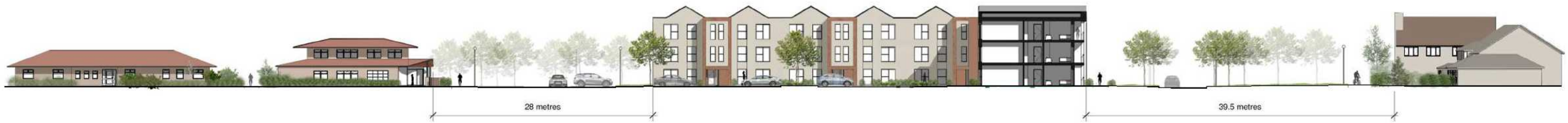
2. Proposed Site Section 02 SCALE - 1 : 500@A3