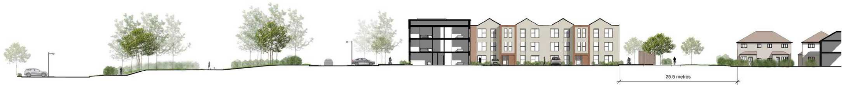
1. Proposed Site Section 01 SCALE - 1 : 500@A3