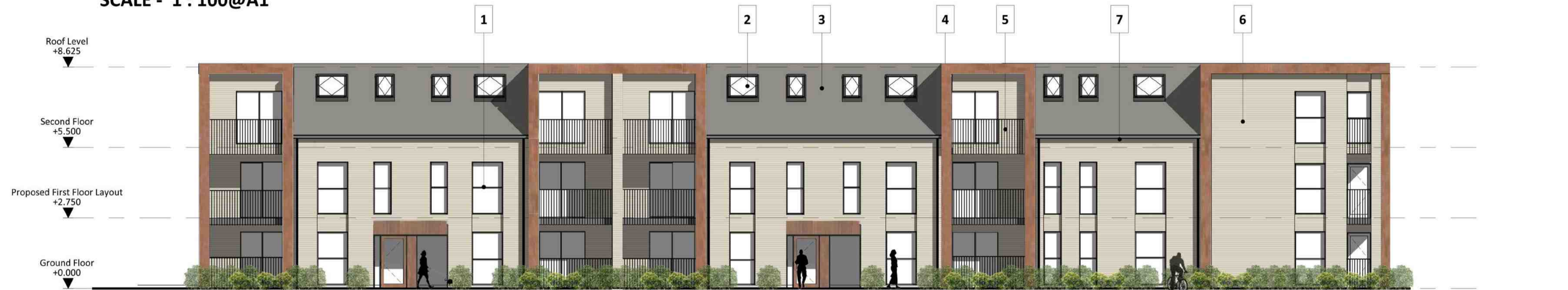
3. Proposed West Elevation SCALE - 1 : 100@A1