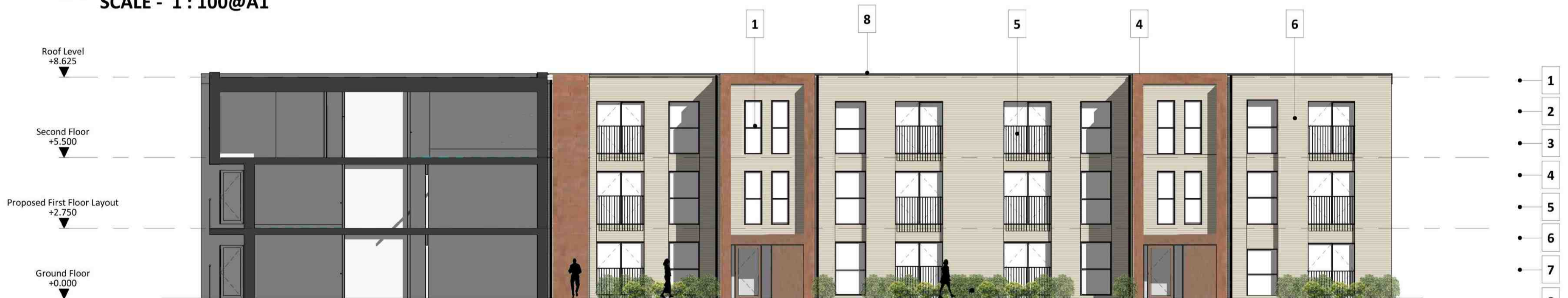
4. Proposed East Elevation SCALE - 1 : 100@A1