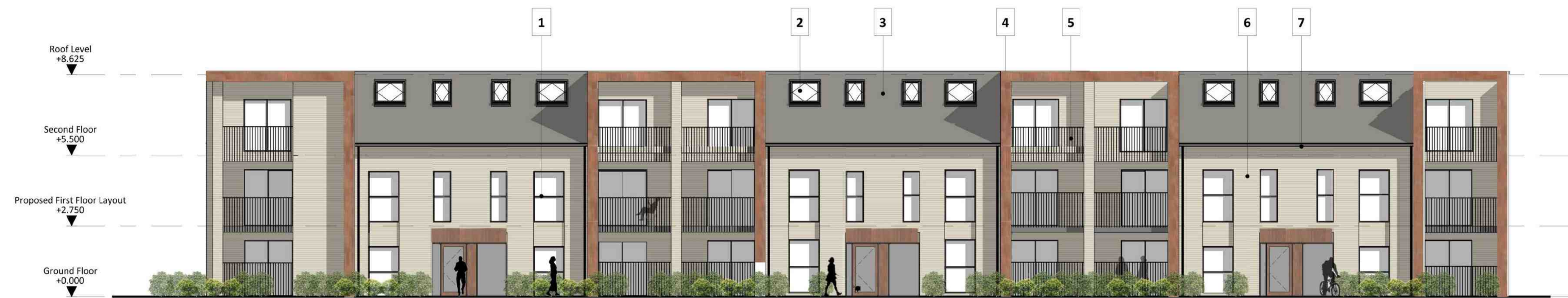
1. Proposed South Elevation SCALE - 1 : 100@A1