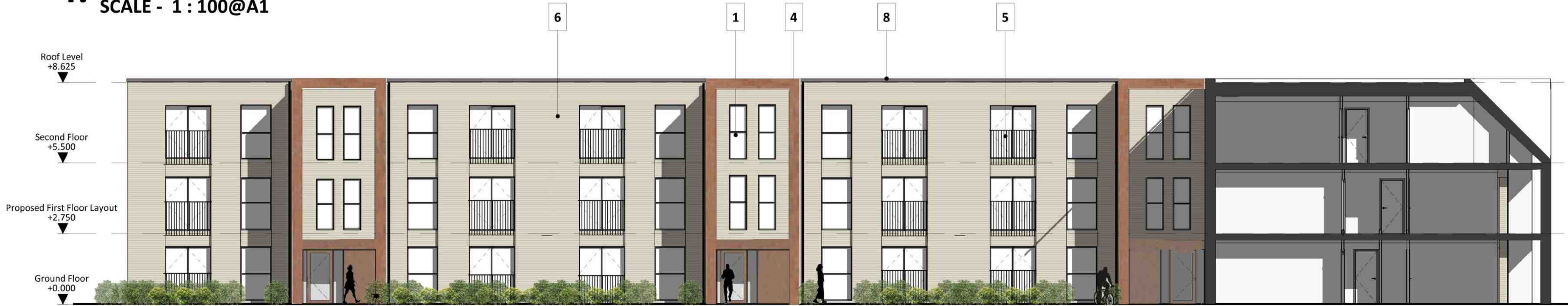
2. Proposed North Elevation SCALE - 1 : 100@A1